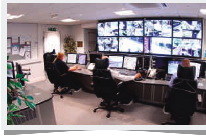
SECURITY AND SURVEILLANCE