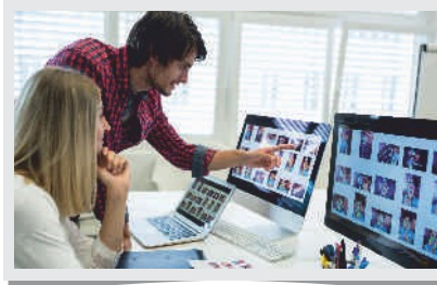
PROFESSIONAL WORK STATIONS